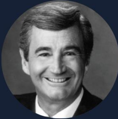
Dr. D. James Kennedy

President and Founder, Dr. James Dobson Family Institute