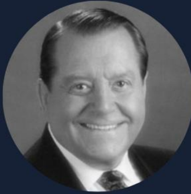
Dr. Bill Bright

Founder, Cru (Formerly Campus Crusade for Christ) (1921-2003)