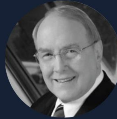
Dr. James Dobson

Co-Founder, Crown Financial Ministries (1939-2003)